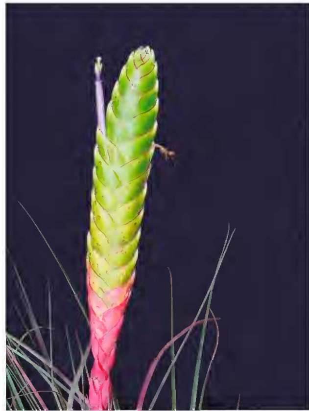
Fig. 1. Tillandsia magnispica Espejo & López-Ferrari ( A. Espejo et al. 6312).